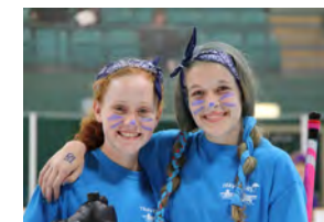
Embrace the spirit of the north