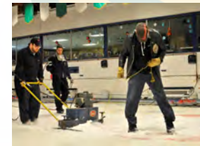
Learn from our pros

Check out our Amethyst Junior Curling Camp; producing many champions for over 20 years.