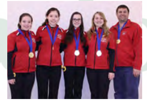
Grown and raised in Northern Ontario