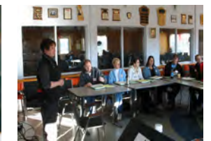
Continued education through lifelong learning