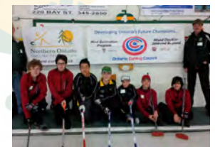
Celebrate the future of our sport